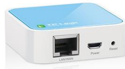
TP-Link TL-WR802N WiFi Router